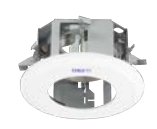
WV-QEM505-W Ceiling Mount Bracket