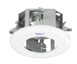
WV-QEM505-W Ceiling Mount Bracket