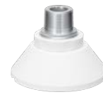
WV-QSR506M1-W Mount Bracket