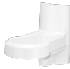
WV-QWL502-W Mount Bracket