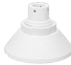
WV-QSR506-W Mount Bracket