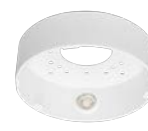
WV-QJB505-W Base Bracket