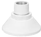
WV-QSR506F-W Mount Bracket