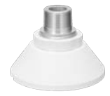
WV-QSR506M-W Mount Bracket