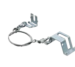
WV-Q105A Mount Bracket