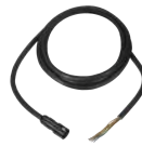
WV-QCA502 I/O Cable for Aero PTZ camera